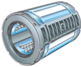
KS25 Bearing 2D drawings and 3D CAD models